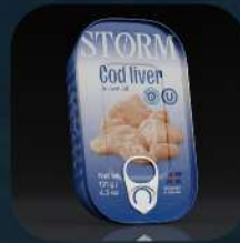
Cod liver 121 g

Dear Partners! Please don't hesitate to contact us if you are interested in cooperation. We are always glad to communicate with you.