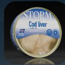
Cod liver 202 g