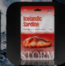
Icelandic Sardine fillets pieces, in tomato sauce 111 g