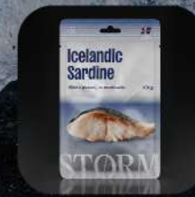
Icelandic Sardine fillets pieces, in marinade 101 g