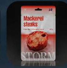
Mackerel steaks blanched, in tomato sauce 145 g