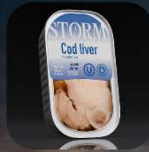
Cod liver 121 g