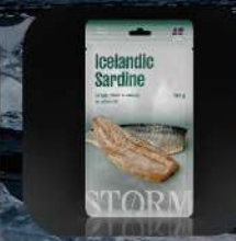
Icelandic Sardine single fillet stewed in olive oil 185 g