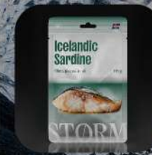
Icelandic Sardine fillets pieces, in oil 101 g