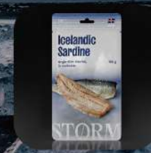
Icelandic Sardine single fillet stewed in marinade 185 g