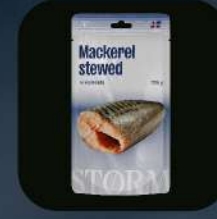
Mackerel stewed in marinade 225 g