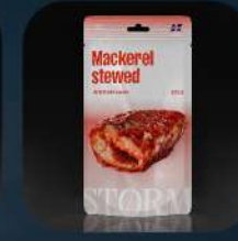
Mackerel stewed in tomato sauce 235 g