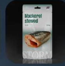
Mackerel stewed in oil 225 g