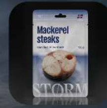
Mackerel steaks blanched, in marinade 135 g