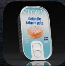
Salmon Pate 125 g