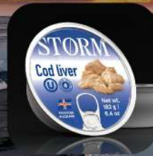
Cod liver 182 g