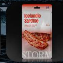
Icelandic Sardine single fillet stewed in tomato sauce 205 g