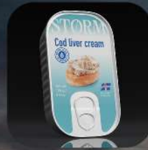
Cod liver cream 125 g