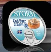
Cod liver cream 185 g