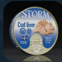
Cod liver 202 g