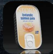
Salmon Pate with lemon 125 g