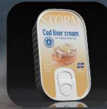
Cod liver cream with lemon 125 g