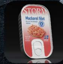
Mackerel fillet flakes in tomato sauce 121 g