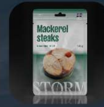
Mackerel steaks blanched, in oil 135 g