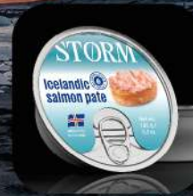
Icelandic salmon pate 185 g